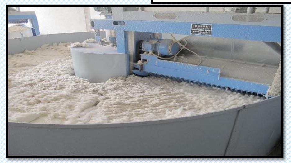
ROUND COTTON PLUCKER