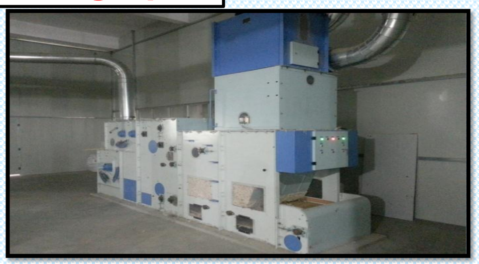
BLENDING MACHINE (WITH CONDENSER)