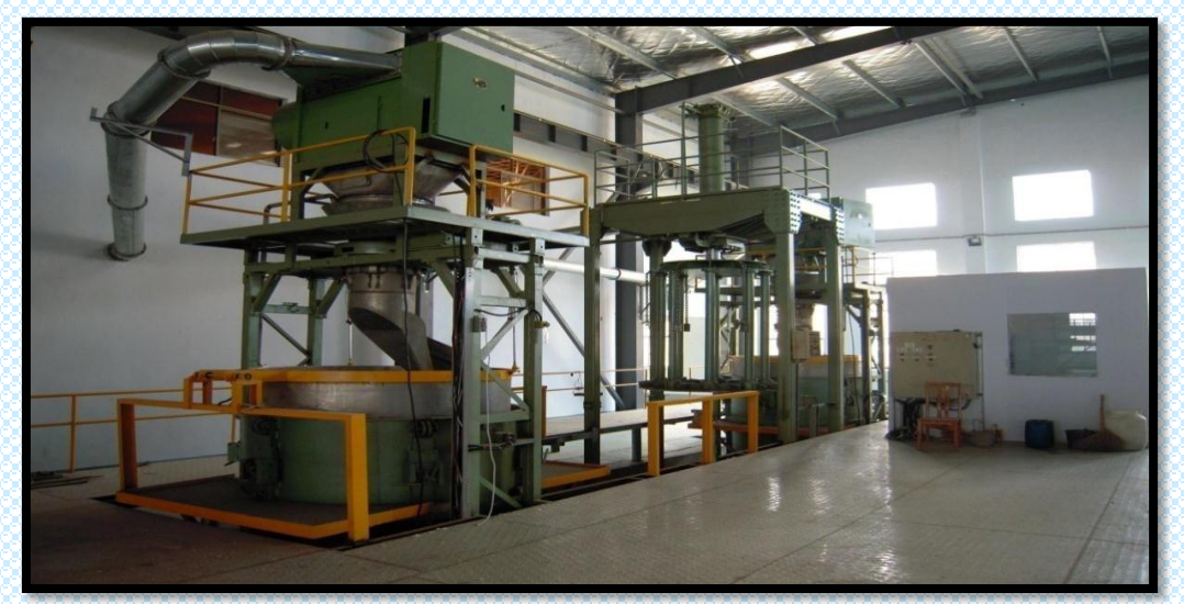
COTTON PRESS MACHINE (WITH CONDENSER + TRANSPORT FAN)